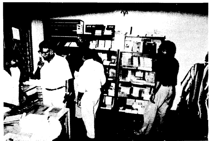
Browsing through the bookshop.