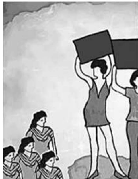
Illustration: Tim Tim Rose

Slutwalk has travelled to India, and with it, has travelled the controversies and divides. Is India ready for a SlutWalk, The New York Times asks. Some will say that it is more than ready, having recently emerged as one of the five worst places in the world for women. New Delhi, where SlutWalk is slated to take place, is known for a high rate of street sexual harassment, rape and violence against women. Public spaces, like the streets, are sites of normalized and ritualized modes of exercising male power and control over women's bodies. In public consciousness, such everyday forms of violence are encapsulated in the misnomer 'eve-teasing'. The latter positions women as actual or potential instigators of sexual desire; temptresses that incite sexualized responses, even harassment and violence from male audiences. The responsibility of a wider rape culture is squarely placed at the feet of women; male violence is normalized if not legitimized.