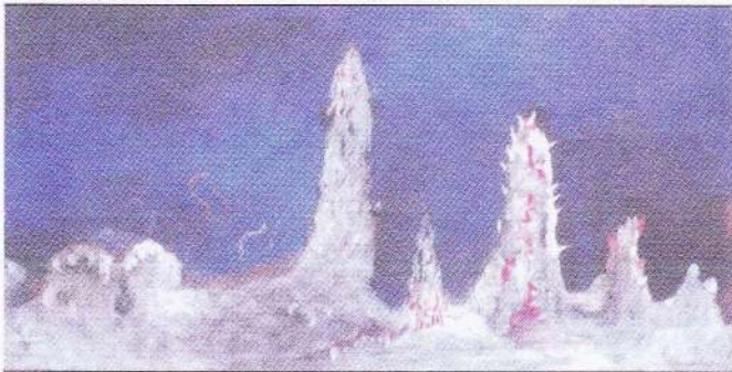
Annex 9 Katugaha + Mythical landscape XIV Mixed media on canvas, 46cm 92cm