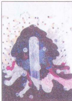
Annex 5 Katugaha + Mythical Landscapes I Mixed media on canvas, 81cm 56cm