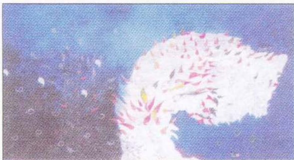
Annex 1 Katugaha+Mythical Landscapes XIII Mixed media on canvas, 30cm 55cm