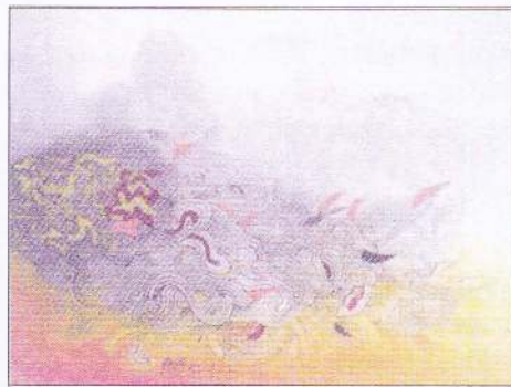
Annex 3 Katugaha + Mythical Landscapes V Mixed media on canvas, 22cm 29cm