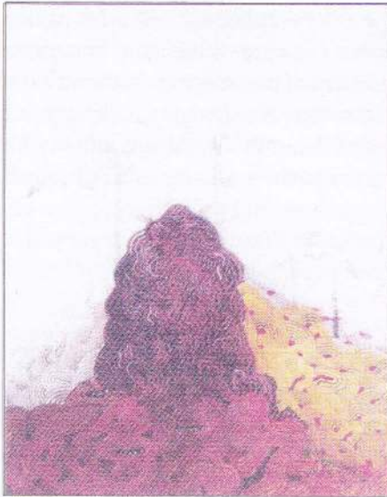
Annex 7 Katugaha + Mythical landscapes XI Mixed media on canvas, 29cm 22cm