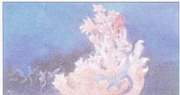
Annex 2 Katugaha + Mythical Landscapes XII Mixed media on canvas. 30cm 55cm