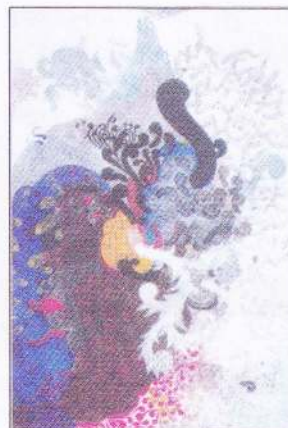
Annex 4 Katugaha + Mythical landscape II Mixed media on canvas, 81cm 56cm